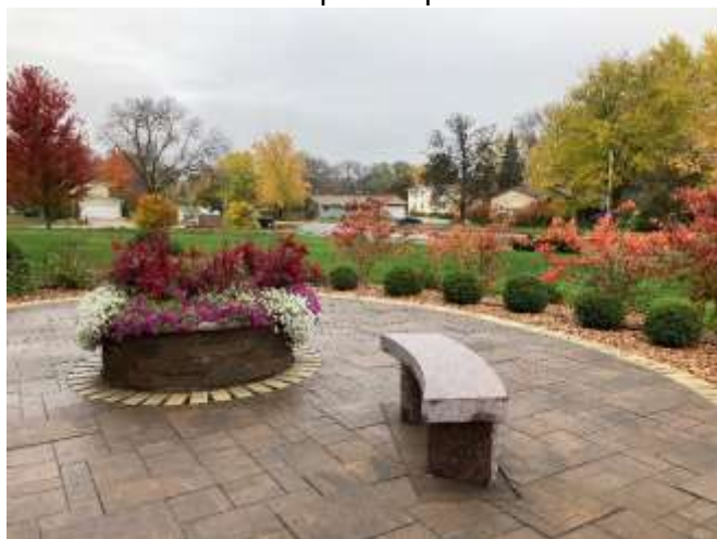
A bench beckons a visitor in to reflect and pray.

The columbarium's beauty as late as October nearly stopped traffic on the newly opened Pleasant Drive. People driving by could see a brilliant setting of beauty encasing the names of those being honored. The maturing shrubs and the fall breeze bent the decorative grasses into rhythmic waves, giving comfort at a most unexpected place.